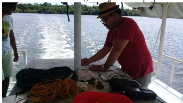
Figure 3. On-Site Water Testing

Other parameters such as Secchi depth, pH, dissolved oxygen, temperature, and salinity were conducted on-site with the help of the LGU and the fisher folks within the lake area. Materials used to determine such parameters were Secchi disk, pH meter, DO meter, thermometer, and refractometer. Lake Danao is a freshwater body classified as class C used for fishery propagation, recreational water class II (boating, fishing, or other similar activities), and agricultural purposes.