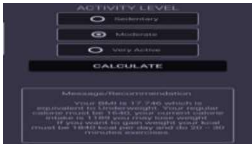
Figure 2. Interface of Weight Diary: (A) Food Calorie Tracker, (B) Recommendation module

Figure 3 shows the result of the time forecasting done using the formulated prediction model.