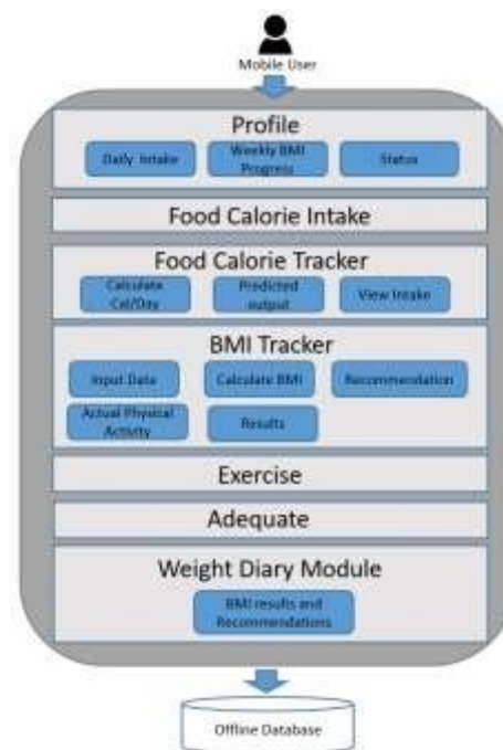
Figure 1. System Architecture

progress. While the Food Calorie Tracker allows the user to input their daily food intake and calculate calories consumed per day and serve as a basis for recommendation because it uses machine learning technique. It also shows the food item list that the user inputted to the system and will be saved to the database. The BMI Tracker allows the user to input personal data like height, weight, age and physical activity level to calculate their BMI range and provide recommendations to improve their body weight. It allows users to save their BMI result to the database. The Food Calorie Intake, on the other hand, shows where the results of food calorie intake are stored. It allows the user to delete previous food calorie data to minimize his/her system storage which can also be used in providing recommendations according to food calorie intake. While, Exercise Module shows the offline recommended fitness workout for the user to help them to improve their body weight. Adequate Module shows the calculated percentage of the weekly calorie intake of the user to predict if the user is going to lose or gain weight. Weight Diary Module shows the saved BMI data results and recommendation and also allows users to delete data results to reduce system storage.