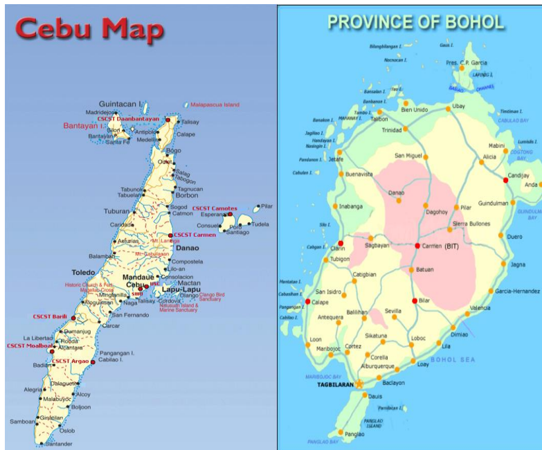
Figures 1 and 2. Cebu and Bohol as study sites